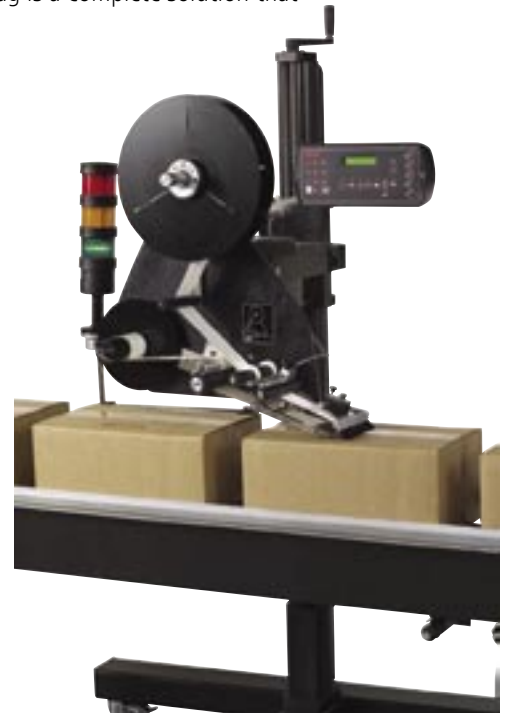
Willet 210 Label Applicator

And FAST Tag is simple to install into your existing operations. From manual to semi-automated or fully automated inline systems, Accu-Sort offers a solution that will make your conversion to RFID an easy one.