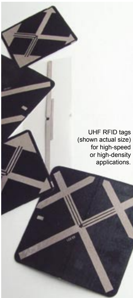
UHF RFID tags (shown actual size) for high-speed or high-density applications.