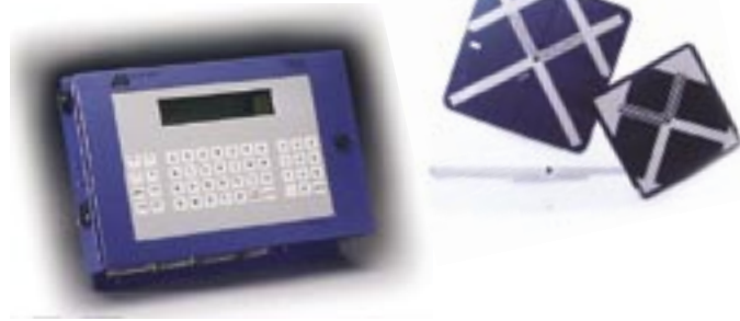
(Left) PC-based Controller 5800, (center) a large variety of RFID tags, (right) a handheld RFID tag/bar code reader