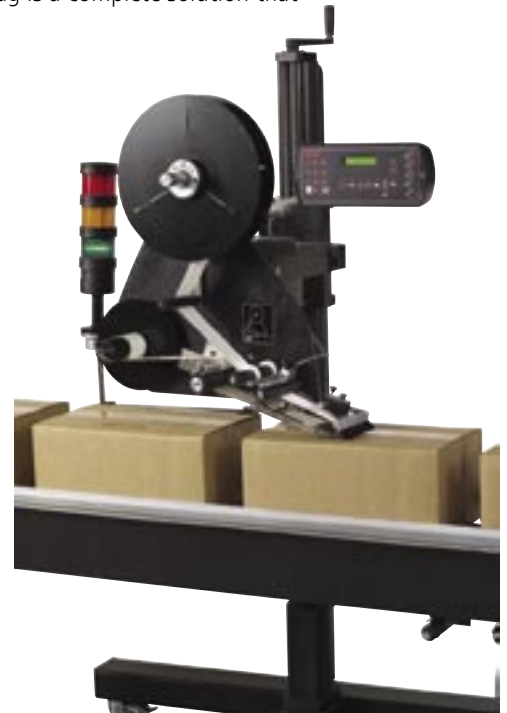
Willet 210 Label Applicator

Since 1971, Accu-Sort has been a leader in automatic identification technology, including bar code scanners, CCD vision systems and RFID technologies. We've helped companies manage materials, collect and analyze data resulting in efficient, streamlined operations. Beginning with your existing material handling infrastructure, our Integrated Systems group provides the right mix of RFID-enabled technology to assure your successful transition to full RFID compliance. Accu-Sort will configure FAST Tag solutions to meet your specific needs. As part of our turnkey solution Accu-Sort provides complete development, installation, commissioning, and support services. See why 80% of all parcels shipped in America are identified by Accu-Sort technology solutions.